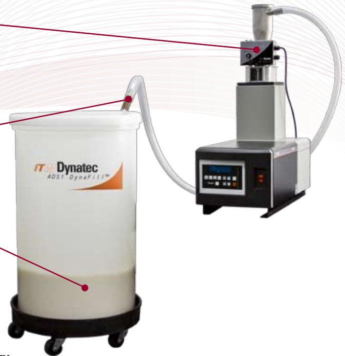
ITW Dynatec - ADS1 DynaFill™ Shown with optional caster base.

Adhesive supply levels are automatically maintained with a sealed system that virtually eliminates system contamination.