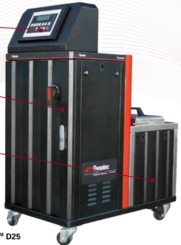
ITW Dynatec - Dynamelt™ D25

Melt-On-Demand hopper extends adhesive life and performance.