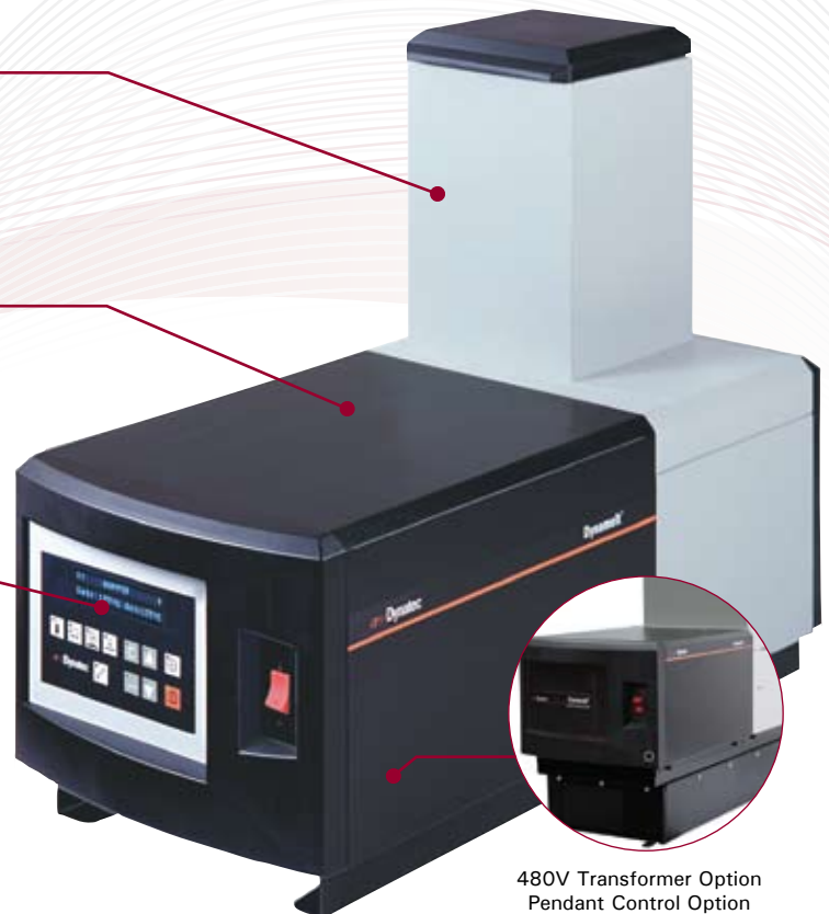
ITW Dynatec - Dynamelt™ S Series Models: S05, S10, S22, S45

Icon-driven control panel simplifies operations.