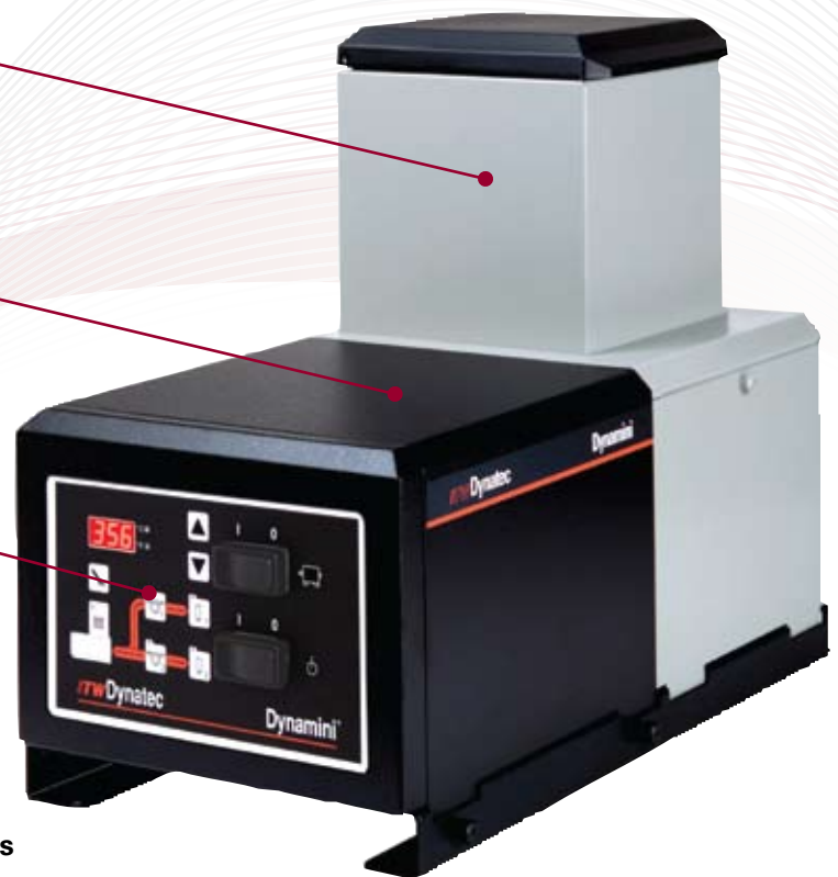
ITW Dynatec - Dynamini™ Series Models: N05, N10, & N22

Icon-driven control panel simplifies operations.