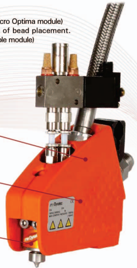
ITW Dynatec - BF MicroBead™ Applicator shown with Single Micro Adjustable Module.

Enhanced built-in filter captures debris and reduces downtime due to clogged nozzles.