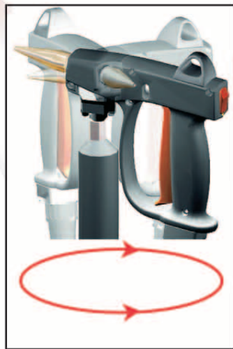
Rotary Swivel (four finger trigger)