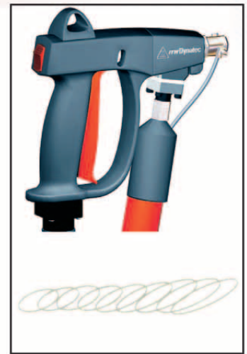
Swirl Spray Nozzle