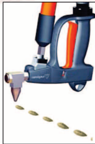
Right Angle Bead Nozzle