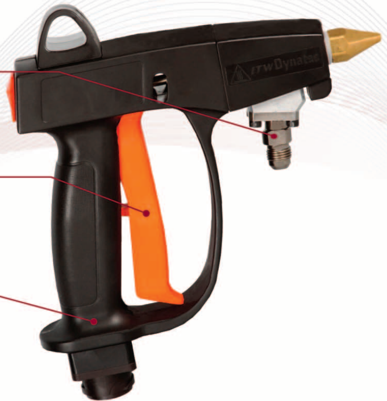
ITW Dynatec - DG II™ Hand Applicator

Rugged and durable glass-filled nylon construction