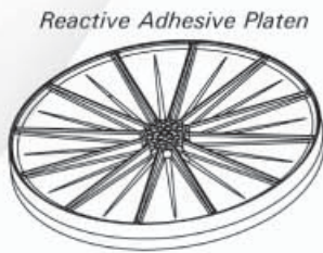
Quick-change high-flow and smooth finned melt platens.