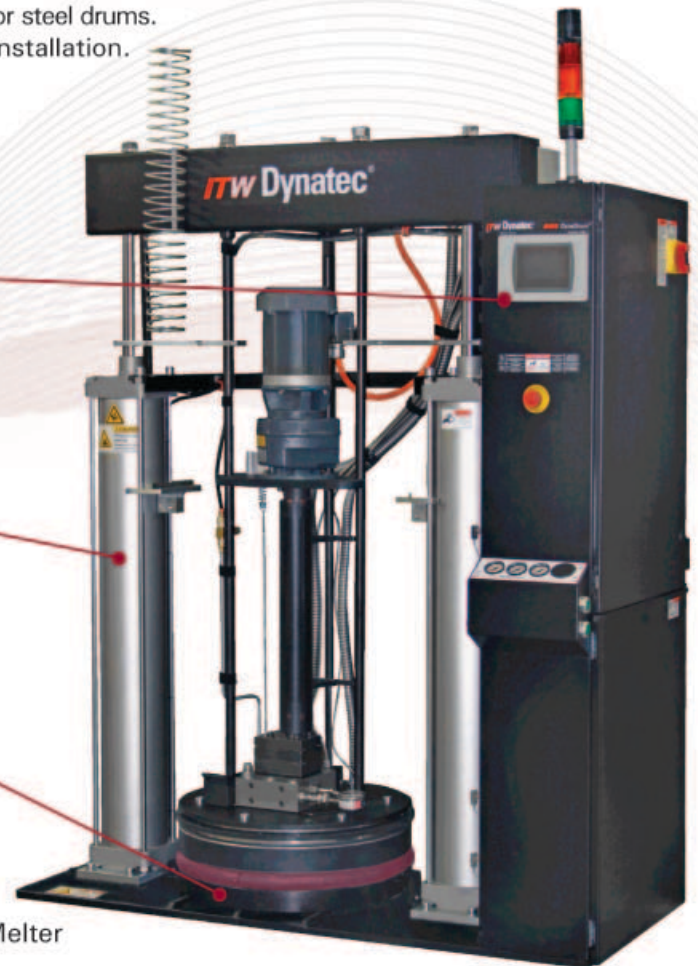
ITW Dynatec - DM55 DynaDrum™ Bulk Adhesive Melter (shown with gear pump option)

Platen faces are available for various reactive and non-reactive adhesives, including PUR.