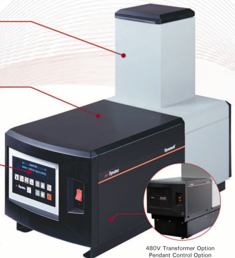
ITW Dynatec - Dynamelt™ S Series Models: S05, S10, S22, S45

Icon-driven control panel simplifies operations.