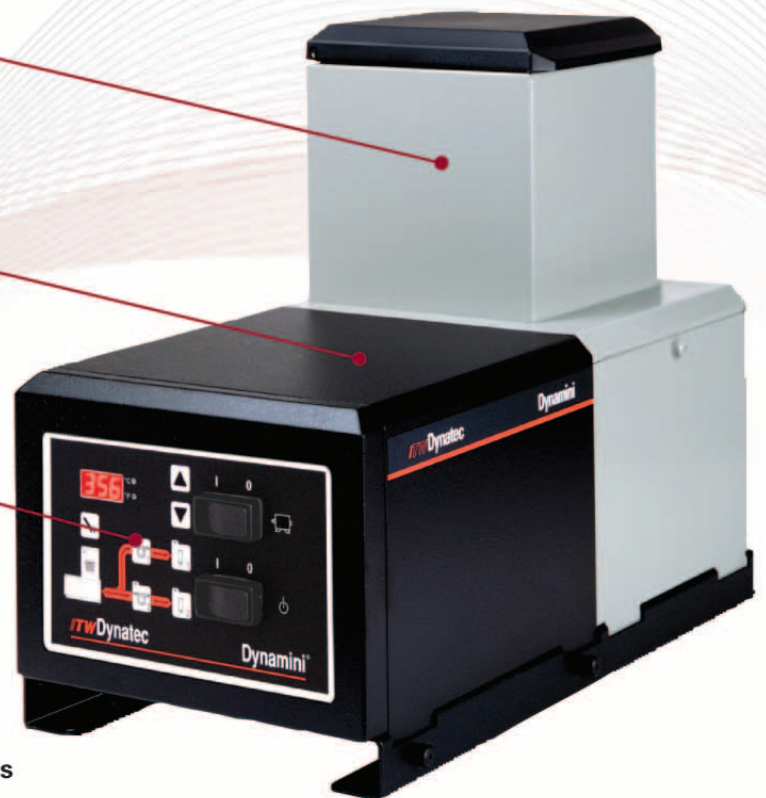
ITW Dynatec - Dynamini™ Series Models: N05, N10, & N22

Icon-driven control panel simplifies operations.