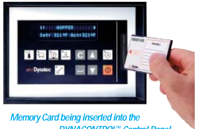
Memory Card being inserted into the DYNACONTROL™ Control Panel