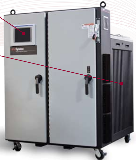
Shown - ITW Dynatec Dynamelt™ M140 and melt grid